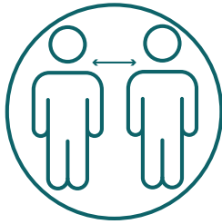
Evolving COVID-19 Measures