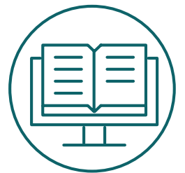
Legislative Library Digitization