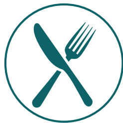
Parliamentary Dining Room Innovations