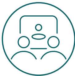
Parliamentary Education Virtual Programs