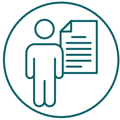
Sustaining House Proceedings