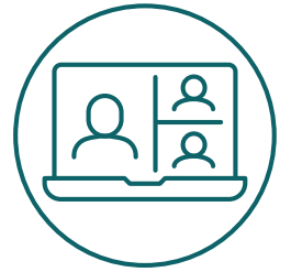
Online Parliamentary Practice in BC, 5th Edition