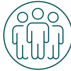
LAMC Governance Framework