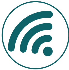
IT and Cybersecurity Investments