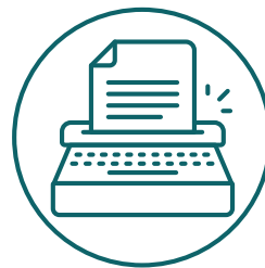
Hansard Broadcasting Investments