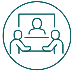
Constituency Office Supports