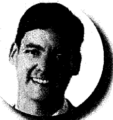
David Eby, MLA Vancouver-Point Grey 604-660-1297