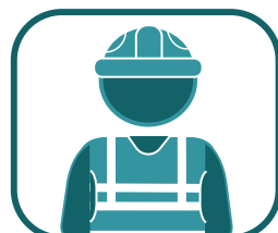
Capital Project Improvements