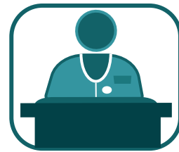
Transition to 42nd Parliament