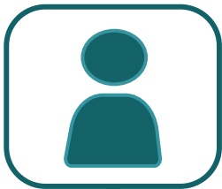
Virtual Public Engagement