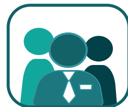
Better Workplace Environment