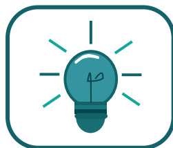
Modernizing Business Processes