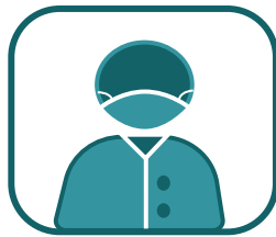
COVID-19 Health and Safety