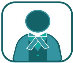
Continuity of House Proceedings