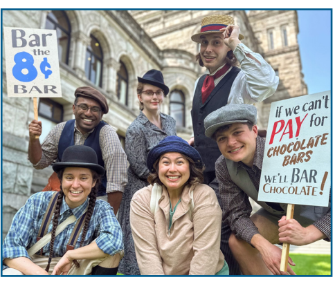
Parliamentary Players, 2023

This summer, over 3,600 enthusiastic audience members of all ages watched the B.C. Heritage Award-winning Parliament Past & Present Travelling Plays. These theatrical experiences whisked visitors around the buildings and back in time. For the first time this year, the Parliamentary Education Office also offered a combined Play and Tour program for schools, which was very popular. One teacher raved, "The play was brilliantly written so that it's interactive, informative and entertaining all in one." Another said, "I was really blown away. I'm so glad 2023 has this in it." Students also expressed their appreciation, saying it made them feel "welcome to be in the Parliament Building," and "excited and interested to learn more about government." Some students even announced that after the show, they wanted to work at the Legislative Assembly some day! If you are interested in the Play and Tour, the offering will return next year in May and June.