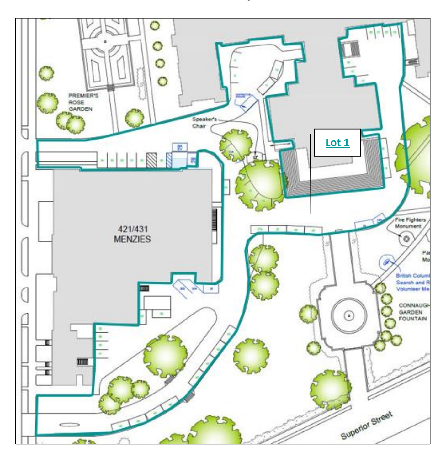
APPENDIX 1 – LOT 1