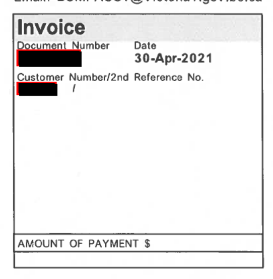
Page 1 of 1

Ministry of Citizens' Services BC Mail Plus PO Box 9453 Stn Prov Govt Victoria BC V8W 9V7 Ph:250-952-5102 F:250-952-5117 Email: BCMPACCT@Victoria1.gov.bc.ca