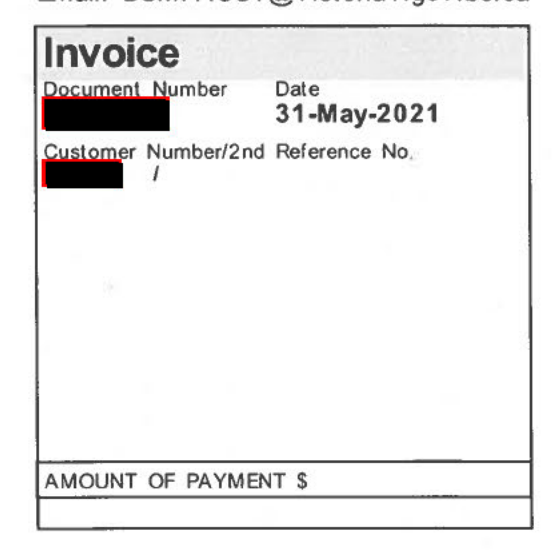
Page 1 of 1

Ministry of Citizens' Services BC Mail Plus PO Box 9453 Stn Prov Govt Victoria BC V8W 9V7 Ph:250-952-5102 F:250-952-5117 Email: BCMPACCT@Victoria1.gov.bc.ca