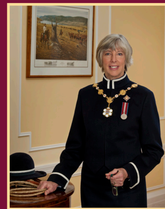
The Honourable Judith Guichon, OBC 29th Lieutenant Governor of British Columbia

For the latest available information on all of these initiatives, kindly visit our website at www.ltgov.bc.ca .