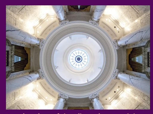
Interior view of the Library's central dome

The Library's mandate has been to meet the information needs of the Members of the Assembly for over 100 years, but how librarians find information has changed dramatically in the later half of the 20th century. Today the librarians communicate with Members through email and offer resources through applications. From card catalogues to e-readers, the Legislative Library of British Columbia strives to meet Member's information needs.