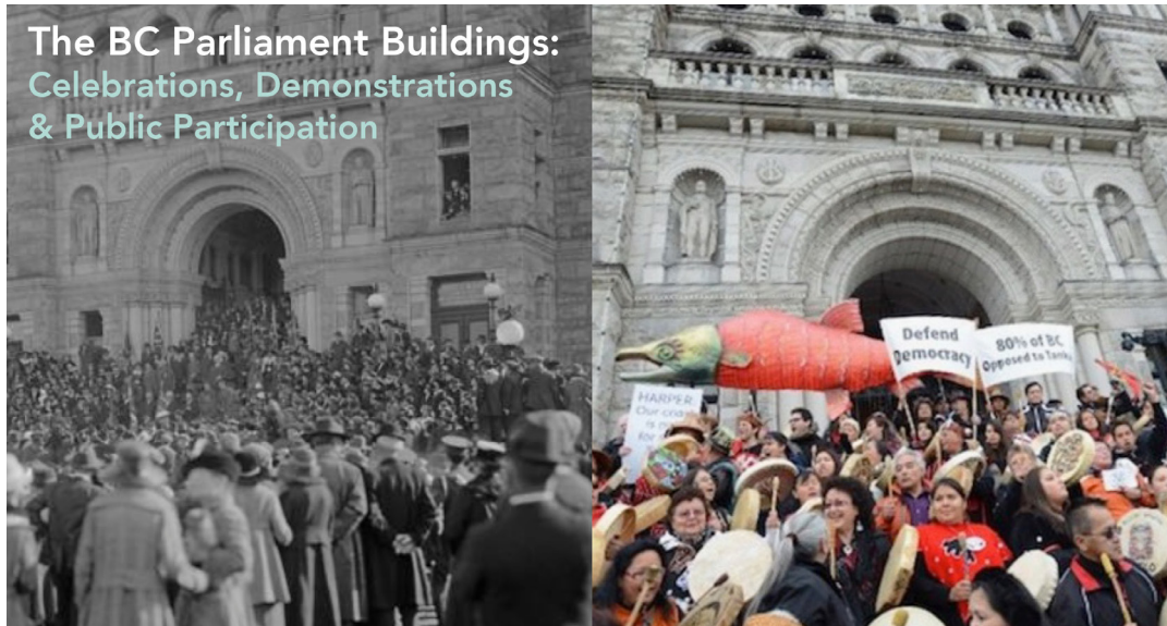
The BC Parliament Buildings: Celebrations, Demonstrations & Public Participation