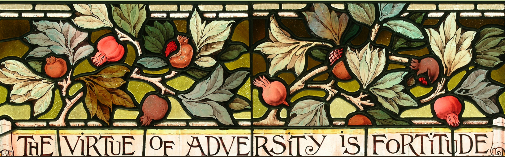
Stained glass window, Parliament Buildings